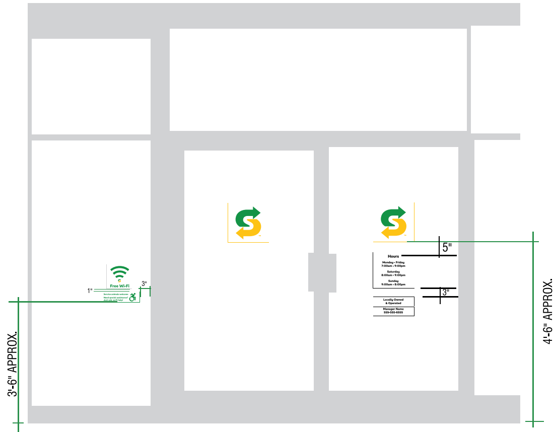
Double Doors with Side Handles