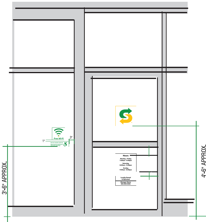
Single Door with Crossbar